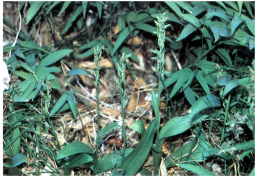
Closeup