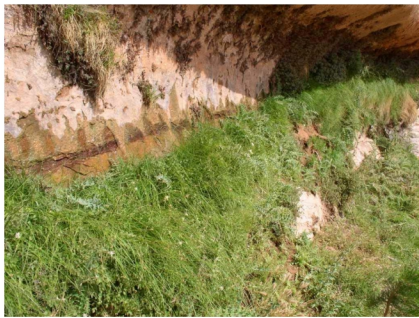
Hanging garden habitat in Arizona and flower closeups