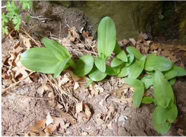
Hanging garden habitat in Utah and plant closeups (S. Topp)