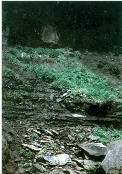
Habitat (D. Trotter)